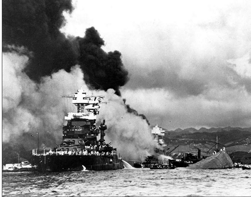
Figure 2. The upturned hull of the USS Oklahoma can be seen in the bottom right corner of the photograph.